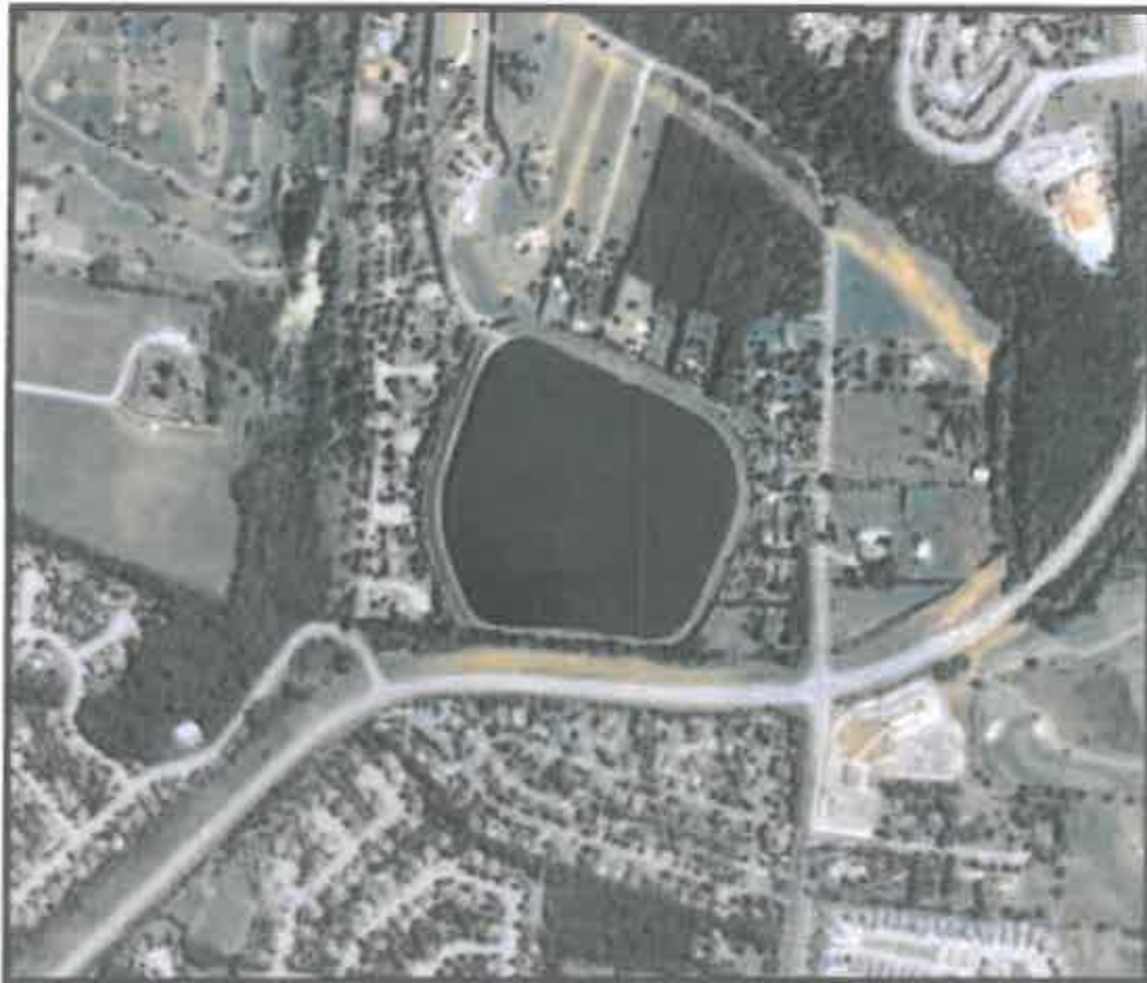
Photo of Franklin Raw Water Reversal