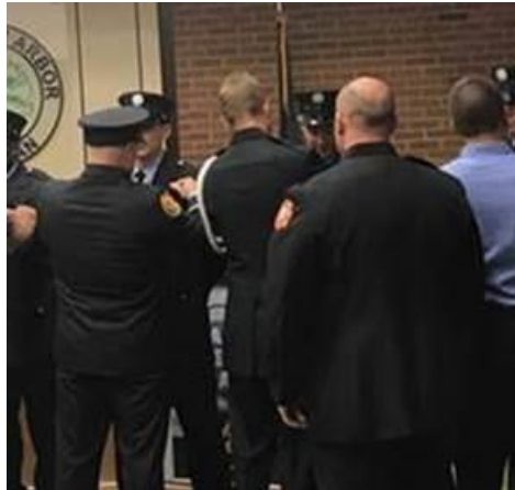
Ann Arbor FD badge pinning ceremony