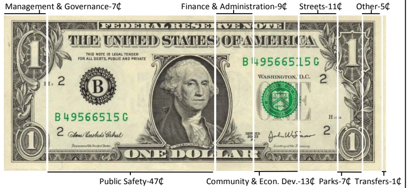
Includes: Only expenses within the FY 2017 General Fund Budget.